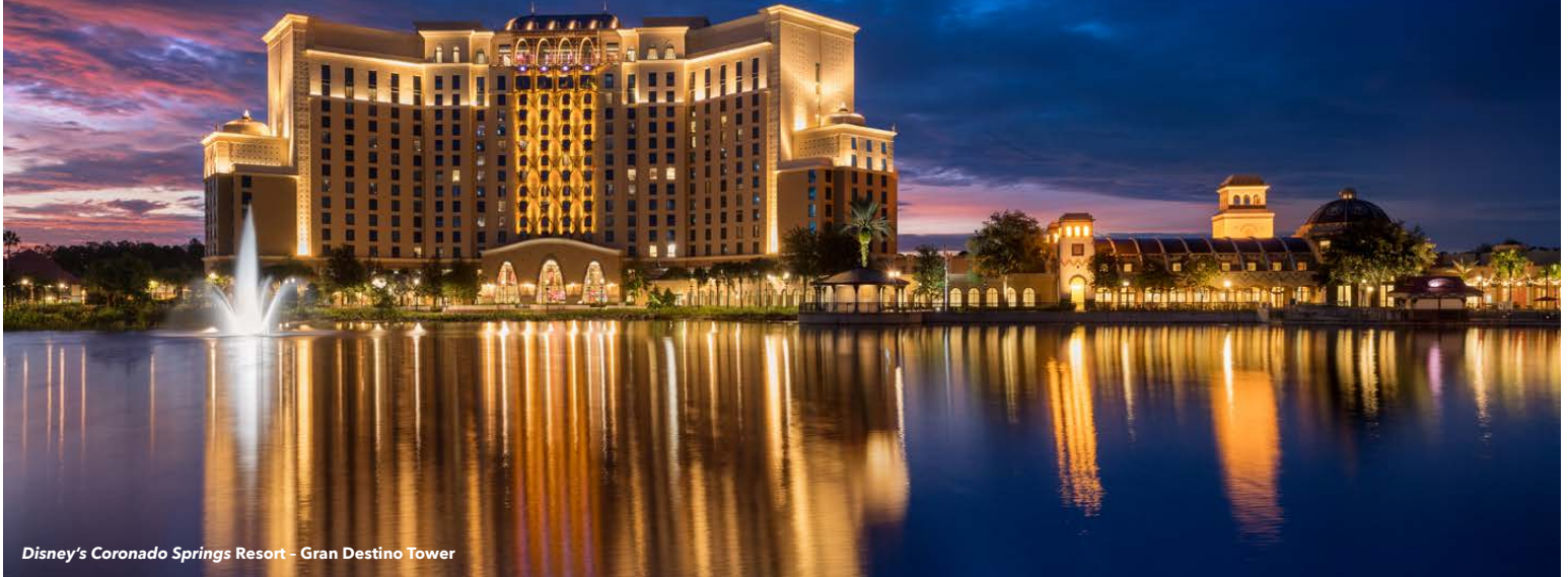
Disney's Coronado Springs Resort - Gran Destino Tower

Celebrate the unique blend of Spanish, Mexican and Southwest American cultures at the newly re-imagined Disney's Coronado Springs Resort . This beautiful lakeside oasis offers classic influences, Disney touches and modern comforts to energize and inspire as you delight in an array of new features, eateries and enhancements.