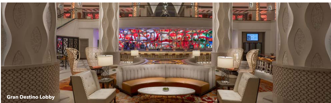
Gran Destino Lobby