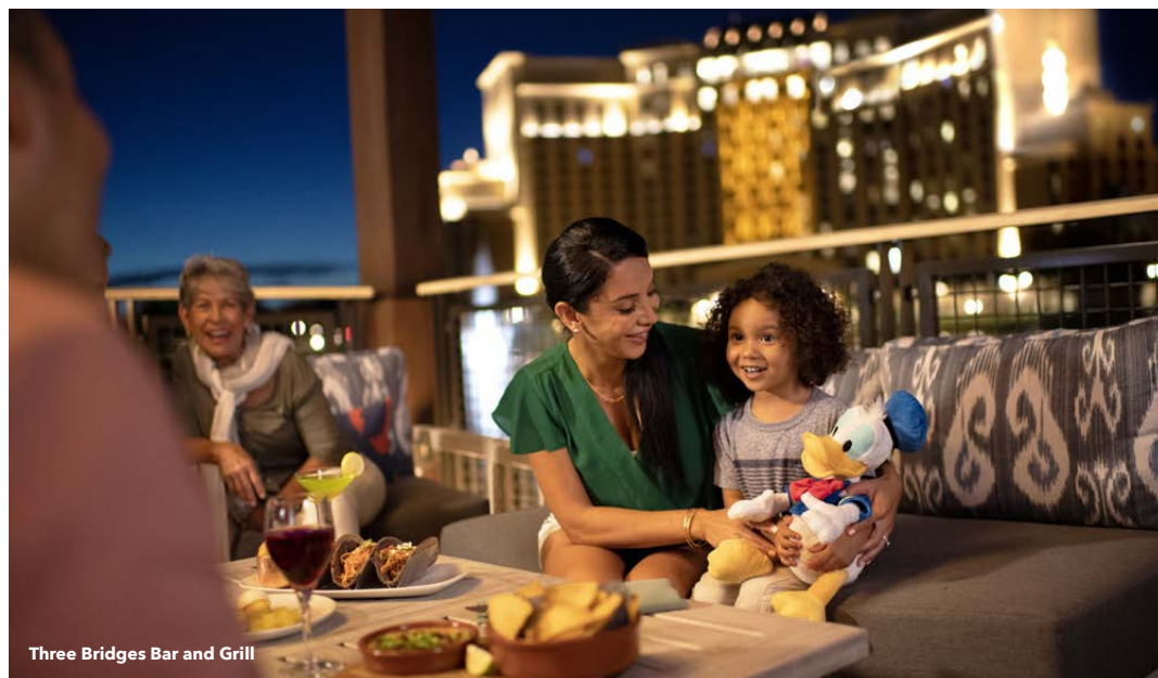
Three Bridges Bar and Grill

Savor espresso drinks, pastries and light fare, as well as cocktails, Spanish and California wines and American craft beers at this hybrid bakery-bar inspired by Spain's coffee and gin culture.